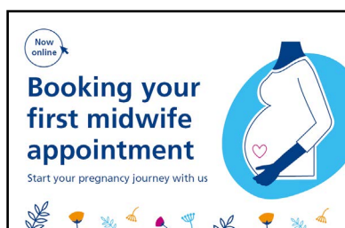
6: Digital button