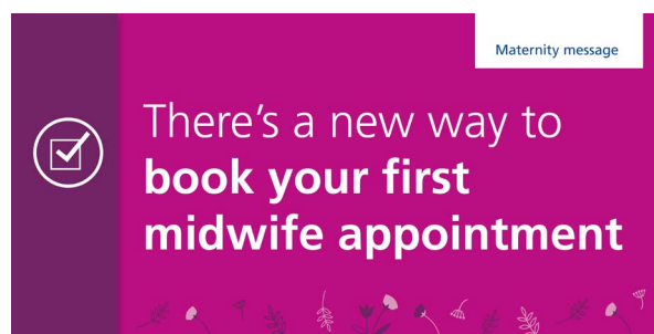
8: Social post