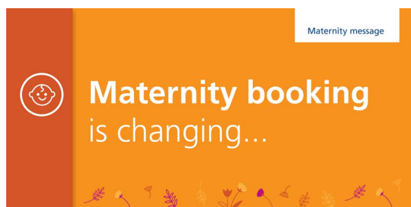
7: Social post