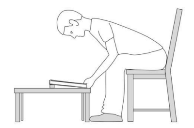
Reading a book from a low table with head in face down position