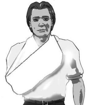
Figure 2: High arm sling

This is used to support the hand and forearm in a position to stop swelling and bleeding.