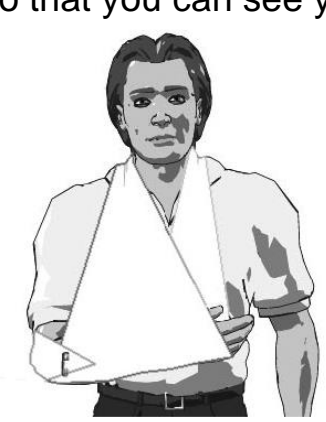
Figure 1: Broad arm sling

Reference No. GHPI0941_02_24 Department Emergency Review due February 2027