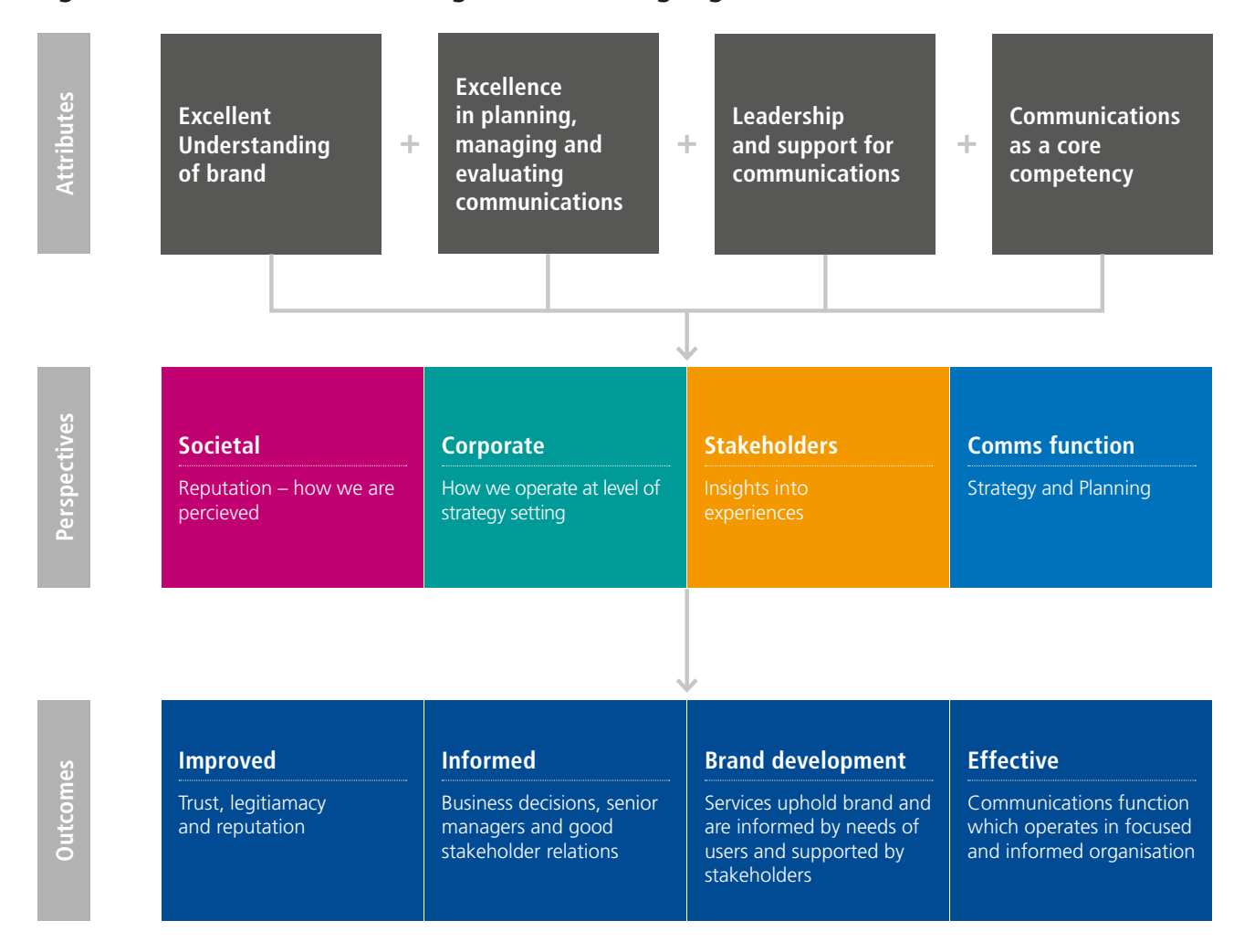
Fig 1. A framework for describing communicating organisations

At the level of the individual, good communication ensures all staff feel they are kept well informed, know where to go to find information, have a voice that is valued and have the opportunity to influence planning and decision making around service development.