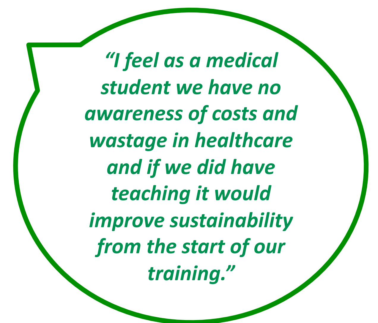
Quote from post intervention questionnaire