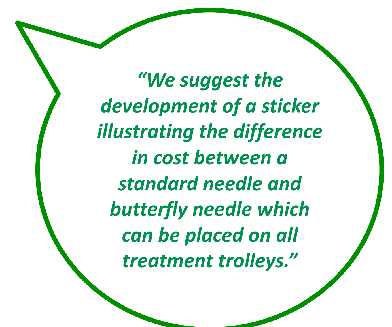
Suggestion from student presentation