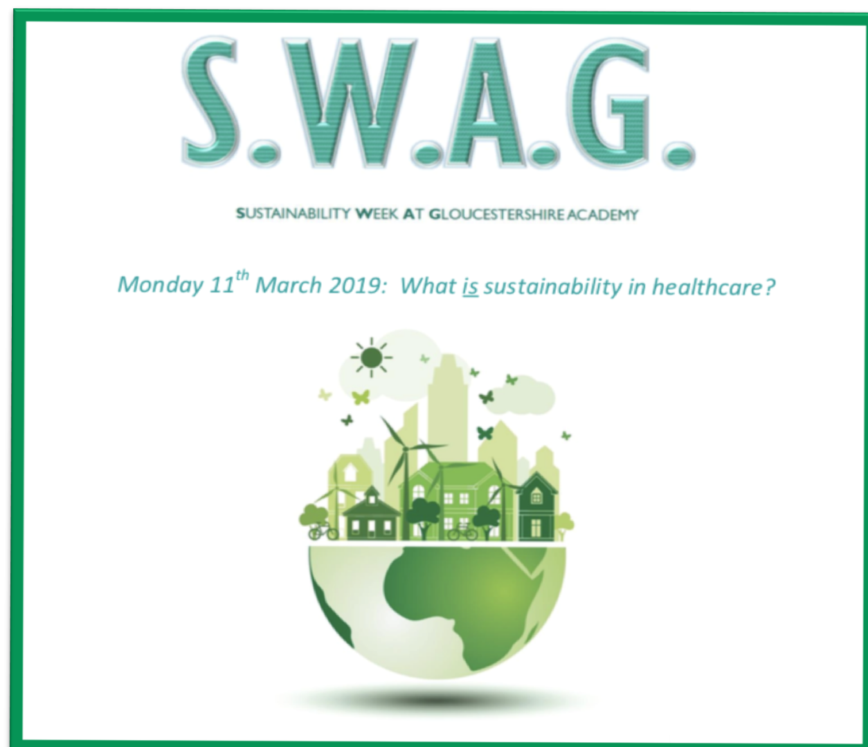
SWAG Daily Email Bulletin

1 Clinical Teaching Fellow, University of Bristol, Gloucestershire Royal Hospital, Great Western Road, Gloucester GL1 3NN