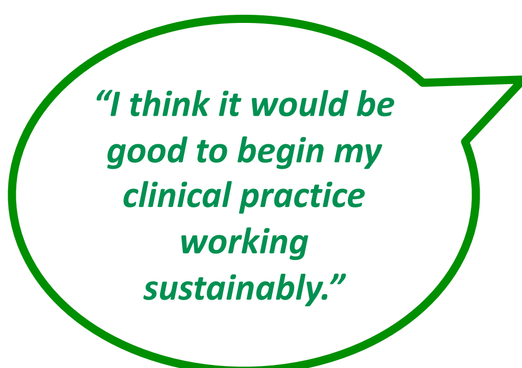
Quote from post intervention questionnaire