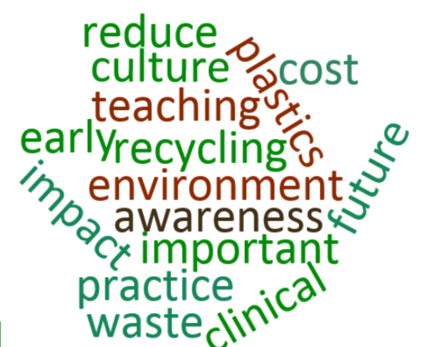
Word cloud developed from questionnaire analysis