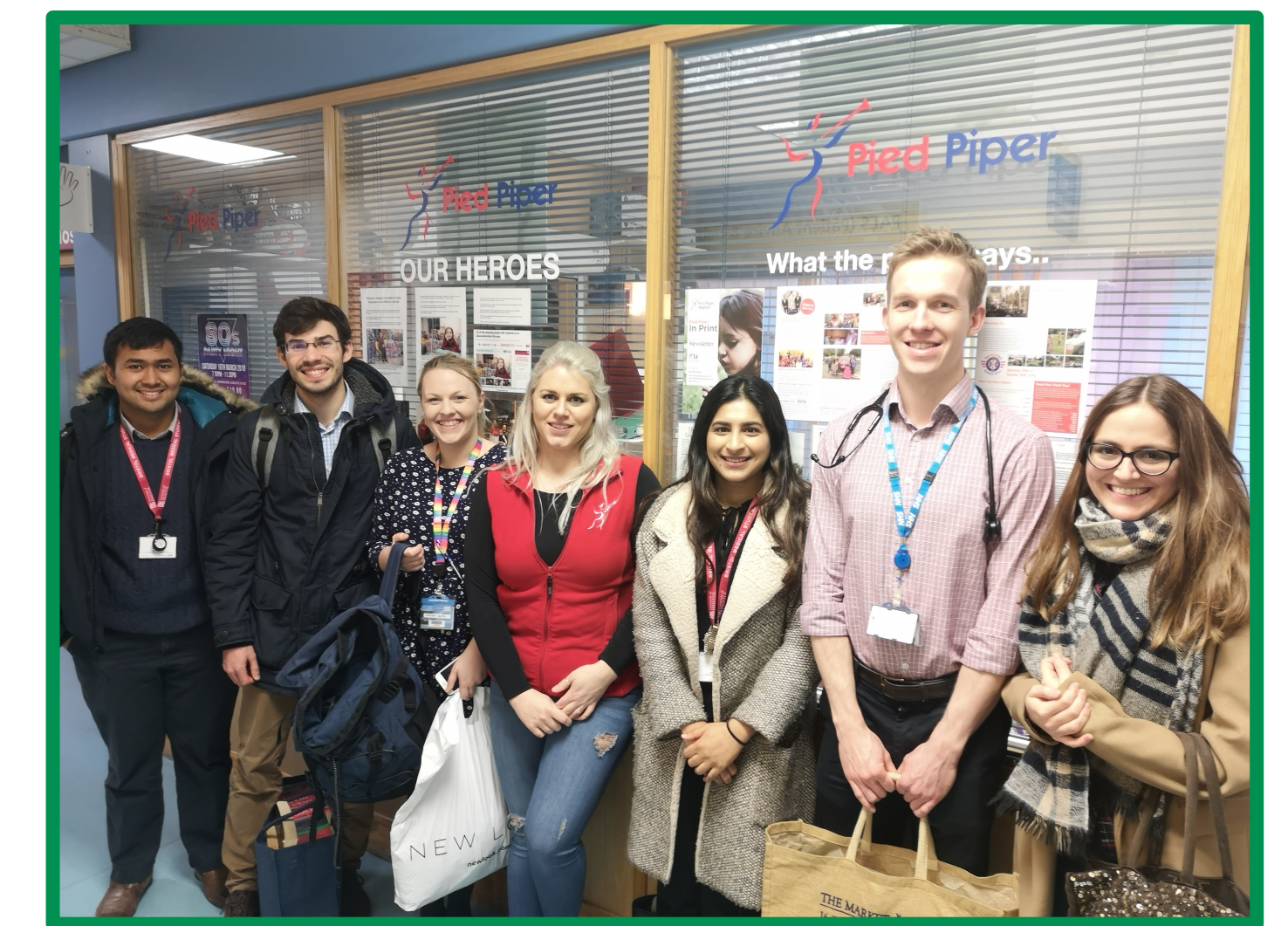
Medical students donating books to the Pied Piper Appeal team