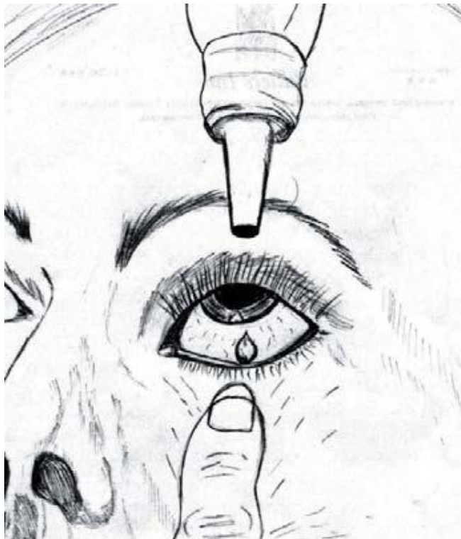
Figure 1: Rest the bottle on your forehead