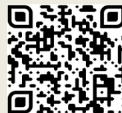
Scan for GSQIA website

Please contact Team GSQIA via email , and visit the GSQIA webpage to book training or find out more about the Academy