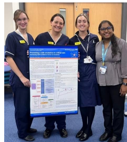
TeamDCC, winners of 'Best QI' at October's Graduation