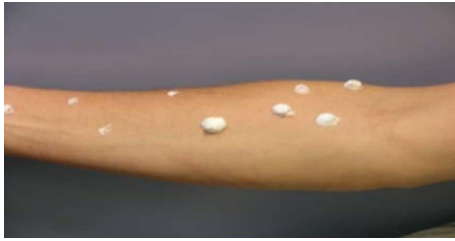
Figure 1: Dot your moisturizer over your skin