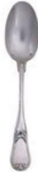
Table Spoon = 10 Pumps