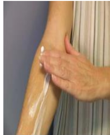
Figure 2: Stroke downwards in the direction of hair growth